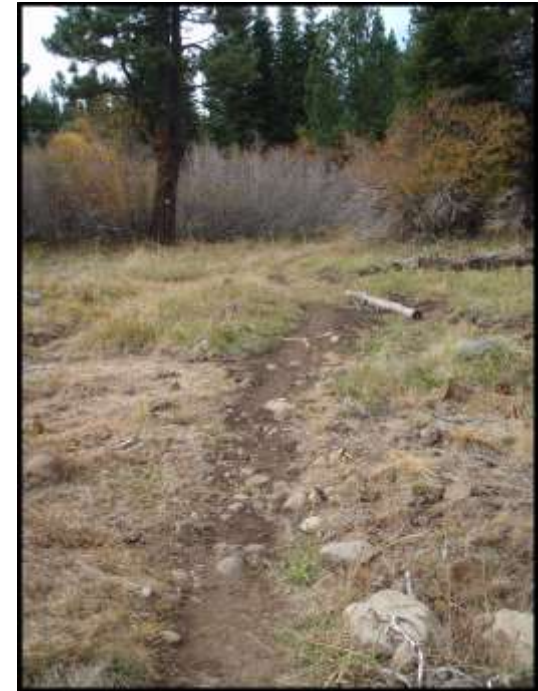
Photo 9c – Lower Reach of Project Looking Upward / Westerly at Area of Reroute & Wetland Rehabilitation

Typical Details & Specifications: T.D. 1-3 (BMP's), T.D. 8 (Rolling Dip), T.D. 9 (Rock Dissipater), T.D. 14-16 (Sustainable Switchbacks), T.D. 17-18 (Sustainable Trail Design), T.D. 20 (Type II Trails)