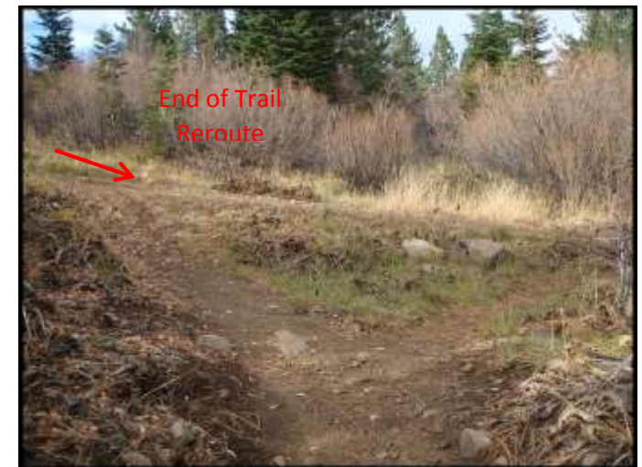
Photo 9d – End Connection Point of Trail Re- route at Dirt Roadway