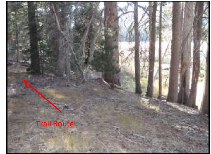
Photo 2a – Trail Bench Location with Euer Valley and S. Prosser Creek in Background

Typical Details & Specifications & Standards: T.D. 1-3 (BMP's), T.D. 8 (Rolling Dip), T.D. 17-18 (Sustainable Trail Design), T.D. 20 (Type II Trails)