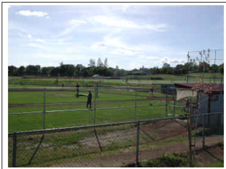
Magnolia Sports Complex Ball Field

One of the most difficult challenges for the District in developing this Master Plan is trying to predict what services and resources the community will need in the future. The District's communities are constantly changing as new people move into the area and other residents leave. Unpredictable shifts in the economy, social issues and