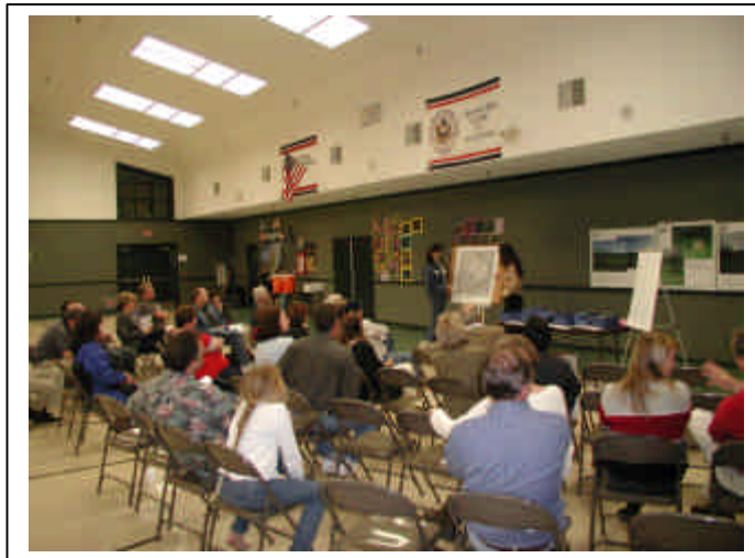
Community Master Plan Workshop

While this Master Plan provides District planning direction for the next fifteen years, it is anticipated that an annual or biannual review of priorities, resources and community needs will occur to make sure that the direction of the District remains consistent with the evolving recreation trends and values of the people it serves.