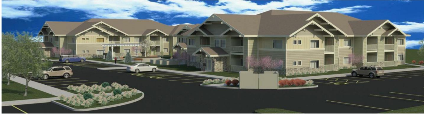
VIEW LOOKING NORTH WEST FROM N. LUCILLE ST.